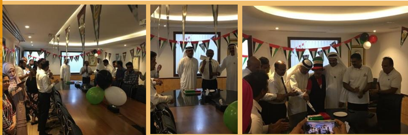
Celebrating UAE National Day