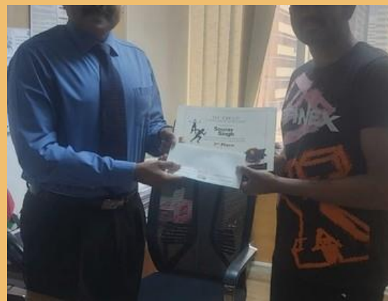
Fitness Challenge winners of 2023