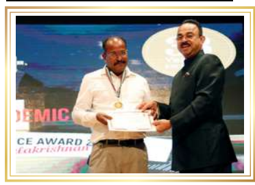
SHARP 2022 - CORPORATE OFFICE CIRCLE OF EXCELLENCE 2021