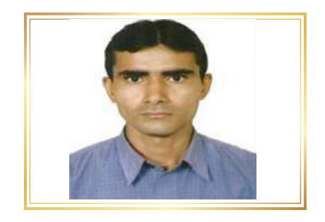
SHARP 2022 - INDIA PALACE BOH ASSOCIATE OF THE YEAR 2021 - ABU DHABI