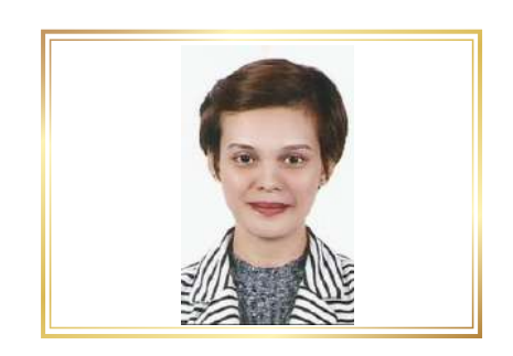
SHARP 2022 - CORPORATE OFFICE SUPPORT EMPLOYEE OF THE YEAR 2021