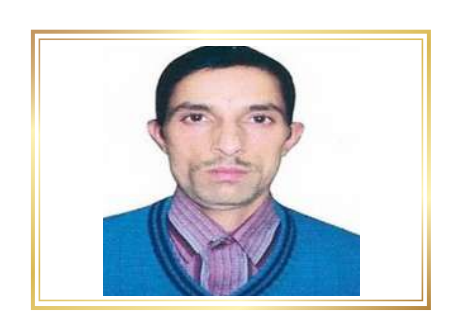
SHARP 2022 - INDIA PALACE BOH TEAMLEADER OF THE YEAR 2021