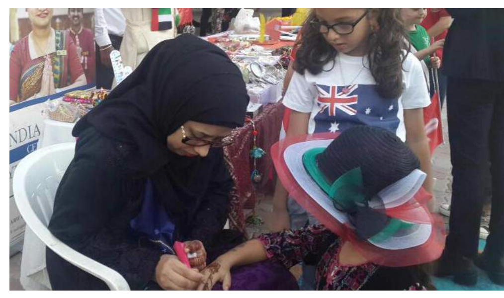
It was our pleasure to serve you